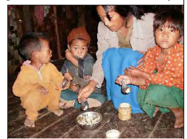
Family sharing one bowl of chopped up roots and vegetables foraged in the jungle.

reporting food shortages due to the lack of adequate roads and communication systems. It is clear, however, from the continued exodus of hungry and destitute villagers into Mizoram State that an escalating problem exists in Chin State. While increased support for a food for work program is appreciated, such programs address only future food production issues and fail to respond to the current food shortages in Chin State and impending humanitarian crisis. Finally, WFP is working under a narrow definition of "famine." Action should be taken to prevent deaths, rather than responding only after preventable deaths have occurred.