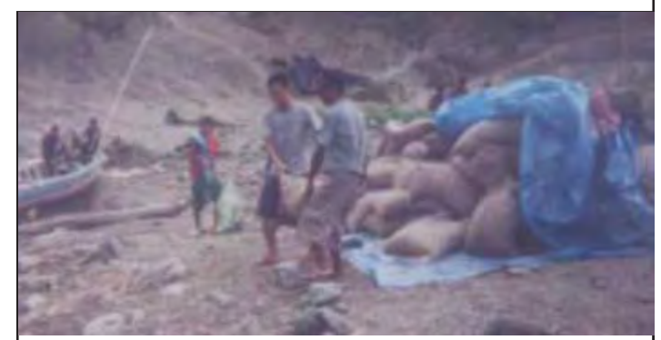
Privately-donated food aid being delivered to villagers in Chin State by the Chin Famine Emergency Relief Committee.

Instead, the military regime has ignored repeated request for intervention and assistance by communities suffering from severe food shortages, and has even gone so far as to obstruct relief efforts meant to assist victims of hunger by seizing more than 300 bags of rice donated by private groups.<sup>29</sup> Burma Army battalions stationed in southern Chin