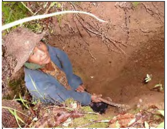
Chin woman digging for edible roots in the jungle.

The World Food Programme conducted an assessment of the situation in Chin State. While they did find that "the [rat] infestation has worsened the food security for many in the affected areas," they concluded that no famine conditions existed in Chin State as "[p]eople are not dying of starvation."<sup>33</sup> Based on this assessment, the WFP has decided to refrain from distributing WFP relief food but has indicated a possible expansion in their "food for work" program in the affected areas.