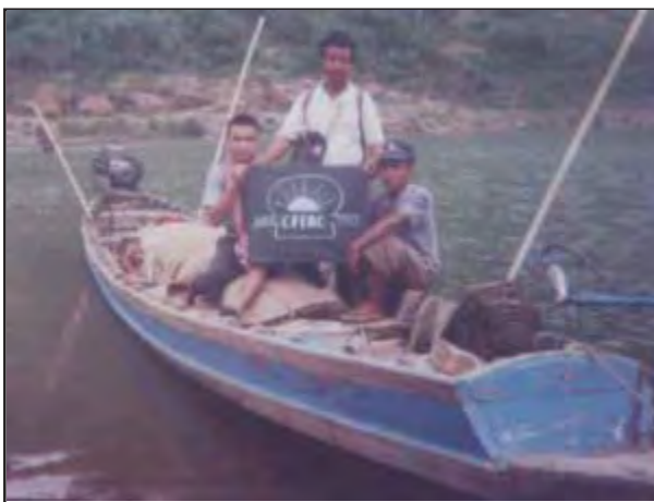
CFERC team delivering food aid to affected areas in Chin State.

Local communities have also organized themselves to fight potential starvation through churches and communitybased organizations inside Chin State. In the Mara area,