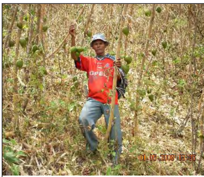
Chin man in flowering bamboo field. (Photo taken by CFERC, 1 May 2008)

The flowering of bamboo has widespread and long-term economic impacts in the region, but the immediate impact is most profound. The type of