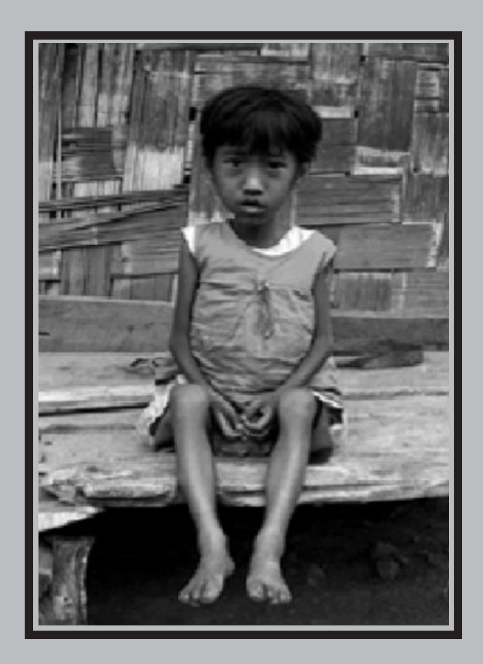
Chin Human Rights Organization July 2008