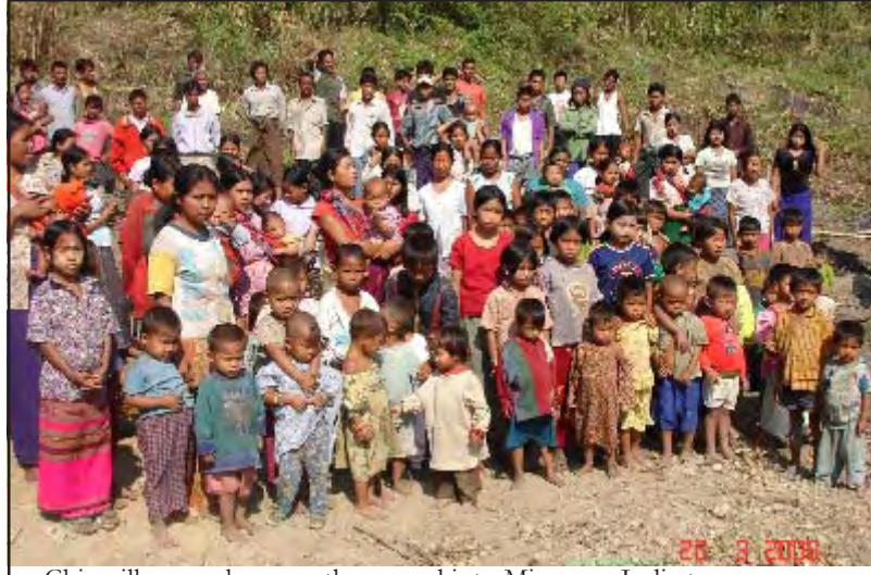
Chin villagers who recently crossed into Mizoram, India to escape food shortages in Chin State. (Photo taken by CHRO, 26 March 2008)

The exodus from this particular area of Chin State started in October 2007, and there are indications that more people from the area will resort to coming into Mizoram in the near future. It is likely that there could be more communities who have already crossed the border into Mizoram whom CHRO has not been able to reach. Since CHRO's visit in March, it has been reported