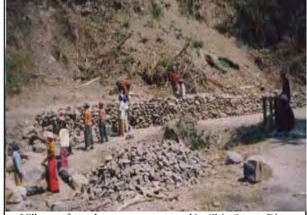
Villagers forced to construct a road in Chin State.

Such practices continue, even in areas most affected by food shortages, such as Paletwa Township of southern Chin State: